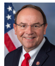
By: Congressman Tom Tiffany

By strangling U.S. energy producers, the White House's policies have fueled skyrocketing oil prices and enriched Russia's rulers. An added