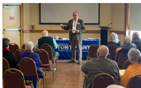
Congressman Tiffany speaks to constituents in Ashland

Social Security benefits and believes they should receive the benefits they've worked for and deserve. However, after some seniors work hard for decades and pay taxes on their hard-earned income to fund the federal government's programs, they are forced to pay income tax yet again on those same benefits.