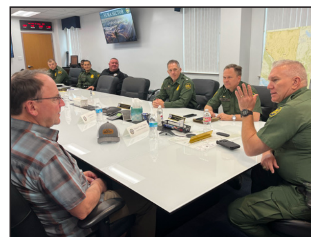
Congressman Tiffany discusses solutions, like finishing the border wall and reinstating "Remain in Mexico," with U.S. Customs and Border Protection agents assigned to the Yuma Sector.