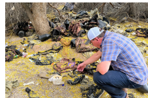
The litter of carpet shoes and camouflage backpacks from drug smugglers in Pinal County, Arizona.