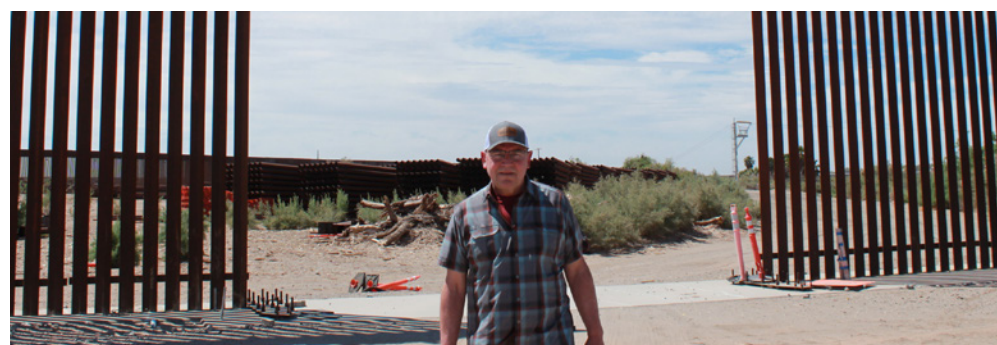
Congressman Tiffany stands in between a gap in our southern border wall where already bought and paid for border wall materials lie behind him, rusting in the Arizona sun, due to President Biden's Executive Order to halt all border wall construction.

Congressman Tiffany believes the solution to this crisis is simple: First, enforce the law. That means completing