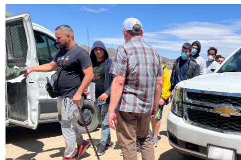
Interviewing migrants who just crossed over the Morelos Dam illegally from Columbia and India. Many migrants pay cartels upwards of $3,000 for their journey to the United States.

There is no sugar-coating what's going on down at our southern border, but the fact of the matter is it doesn't have to be this way. This crisis at our southern border is not a political issue, it's an American issue, and it's long past time to change course.